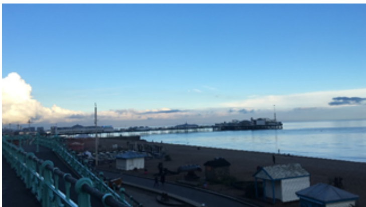
The Brighton Pier at the sea

I went to the European Conference on Social Media in Brighton, United Kingdom. The conference took place at the University of Brighton, Moulsecoomb Campus, on 13th and 14th of June, 2019. The contribution I presented was about 'The Social Media Usage of Asylum Seekers in Germany.'