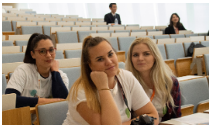
Attendees of BOBCATSSS 2019

The best part of the conference was to meet new people, especially students from all around the world. Sharing ideas, experiences and views with professors and students in formal and informal way is the whole point of symposiums and conferences. As volunteer at this conference I was pleased to see people having fun and enjoying their stay in Osijek and on Bobcatsss2019 conference.