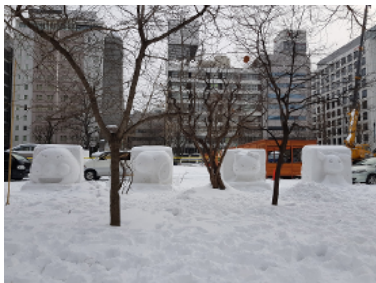
Some cute Snow Sculptures in Sapporo, Japan.

During the conference we could already spot the preparations for Sapporo’s Snow Festival as well