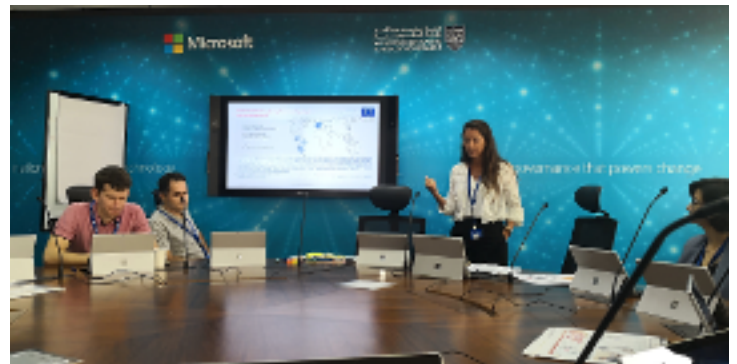
Workshop "Towards a Smart Sustainable City Roadmap"