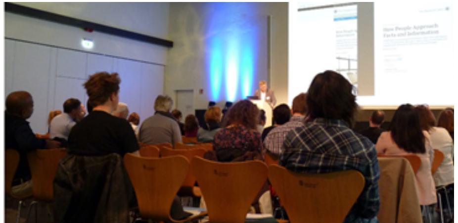
Information Science Trends symposium at the Hamburg University of Applied Sciences, Germany