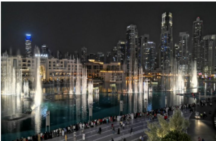
Water fountains at Dubai, VAE

The 20th Annual International Conference on Digital Government Research in Dubai, VAE