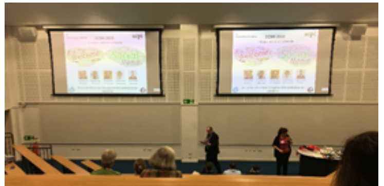
The Conference Chair awards the winner of the best poster award at the conference closing

The poster session was my favorite, because you are able to speak with the researchers in a more familiar way and it is easier to ask questions if you were not able to ask them during a session. Also, there was a session about refugees, which is connected to my research topic, and I really liked that.