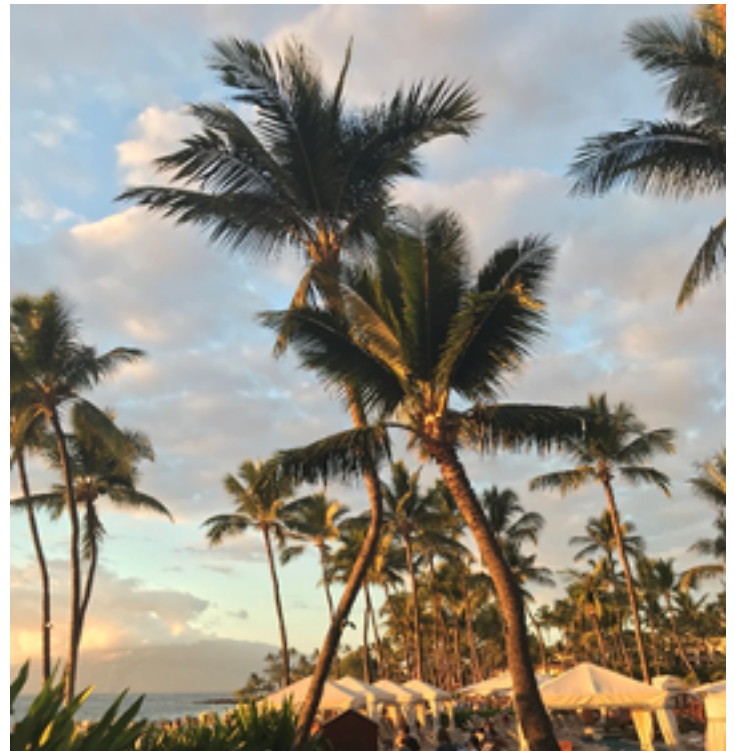
Beautiful sunset at the conference venue on Maui