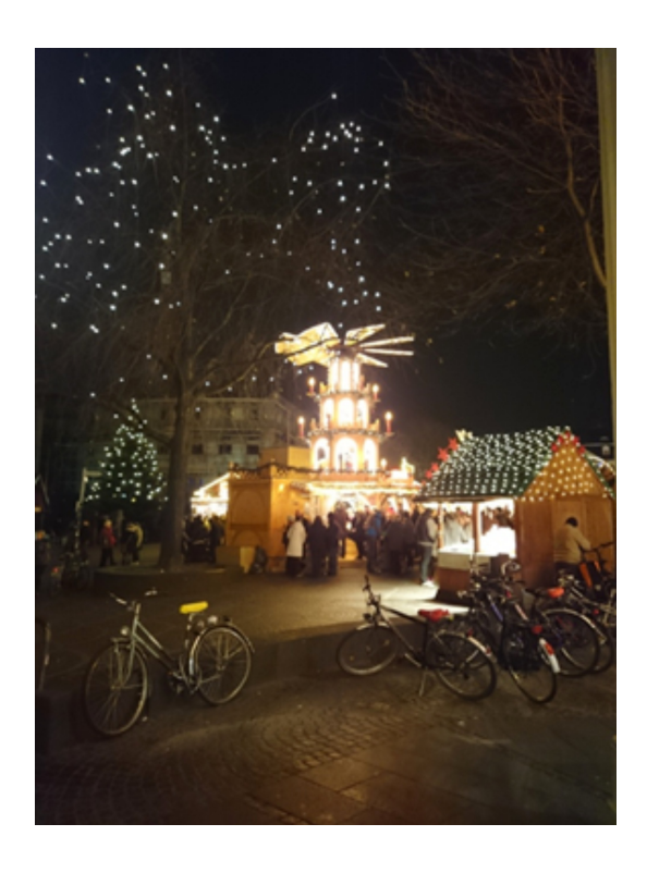
1 December in Bonn.