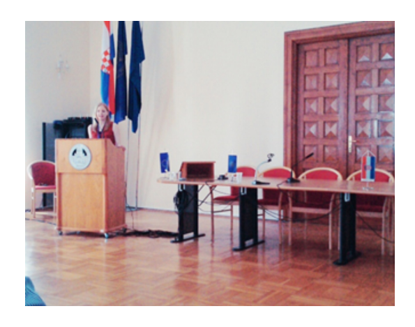
Bella presenting in the great hall at Zadar University