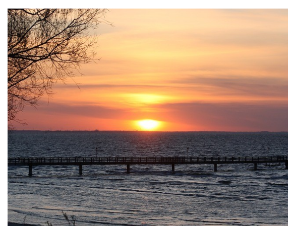
Newport Beach, California