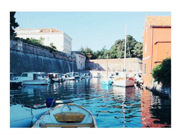
View close to the conference venue

To visit a conference is amazing. There are a lot of researchers with so different and very interesting topics. You hear and learn things about themes where you maybe never think about before. This is really nice. Moreover you get the chance to socialize with other researchers and students. For you it is a big chance to present your work and to get feedback or new ideas. Practice makes perfect!