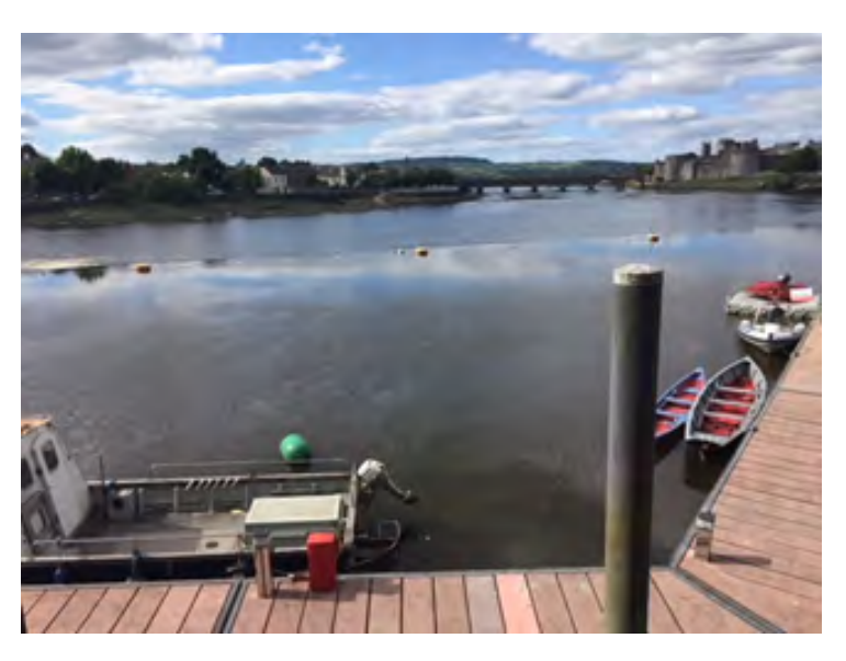
View over the harbor of Limerick

The 5th European Conference on Social Media in Limerick, Ireland, held on the 21st & 22nd of June.