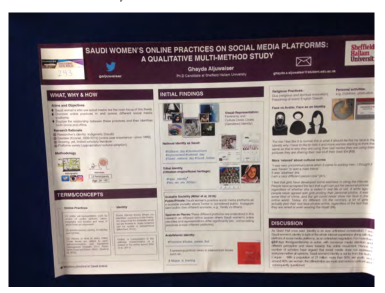
Poster session at the iConference

Moreover, I really liked the fact that plenty of topics presented were somehow socially engaged, e.g. concerning the refugees or women rights. I found it really comforting that the digital world and economy is not dominated by the purely economic perspective. It was nice to see the presentations of people who apparently share my conviction that issues are mostly social ones.