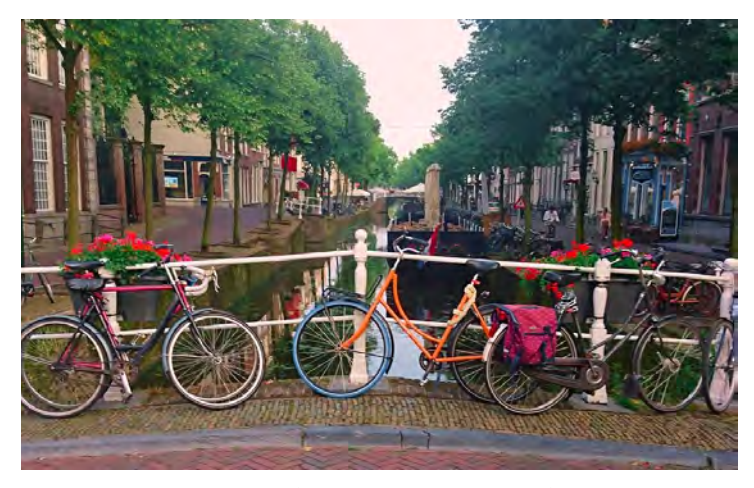
One of the canals in Delft.

The comparatively small dg.o community, we feel comfortable with them right from the beginning. The wide range of topics from open data education over citizen-participated infrastructure building to data sharing portals were very impressive. We will never forget the conference award dinner. It was a medieval theme dinner with a special atmosphere, minstrels, a jester, a witch and very much food!