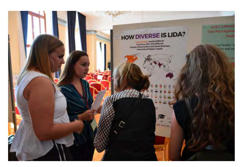
Poster session at LIDA 2018

I really liked the opportunity to talk with people from different cultural circles and from different parts of the world. It enabled me to understand theirs, but also my points of view. I also really liked the poster session because of the spontaneous atmosphere.