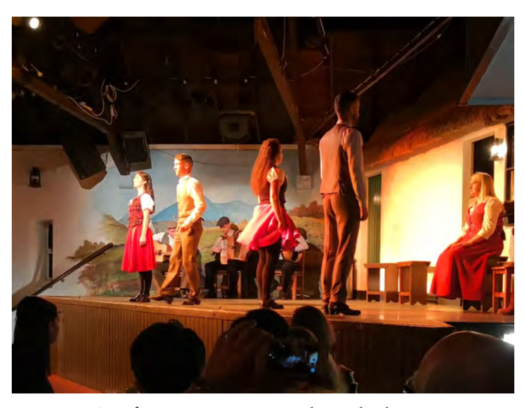
Conference Dinner with Irish dance

Everyone at the conference was really friendly and nice. Also, we went to an event dinner at Bunratty Castle. We had really good Irish food (salad, lamb or salmon, as well as apple pie) and learned a lot about Irish tradition (e.g. songs and dancing).