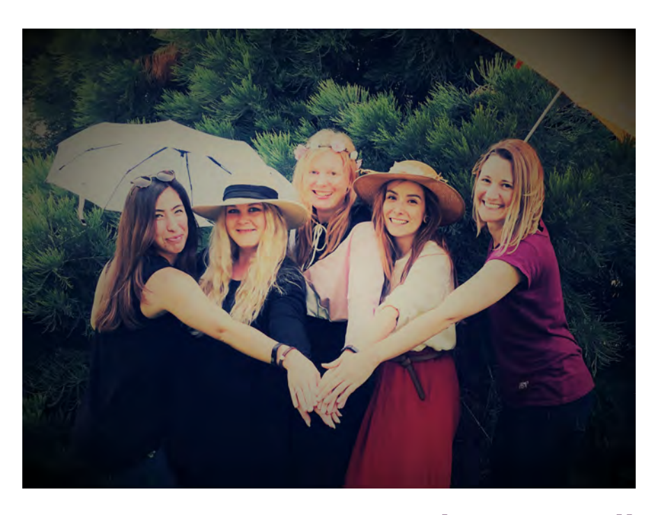
Have a great summer and see you all @ASIS&T 2018 in Vancouver!