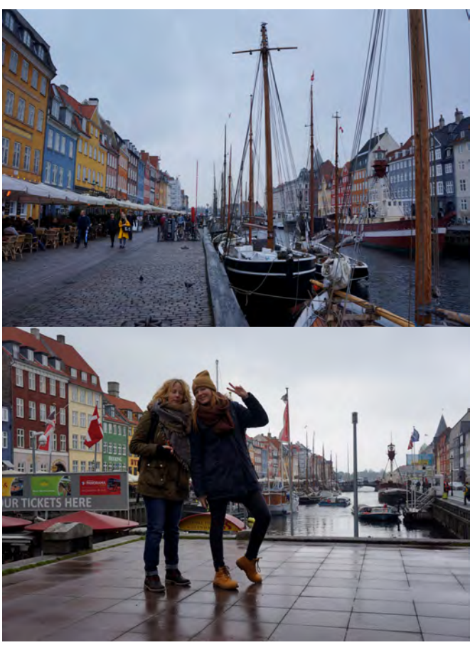
Saying goodbye to Copenhagen