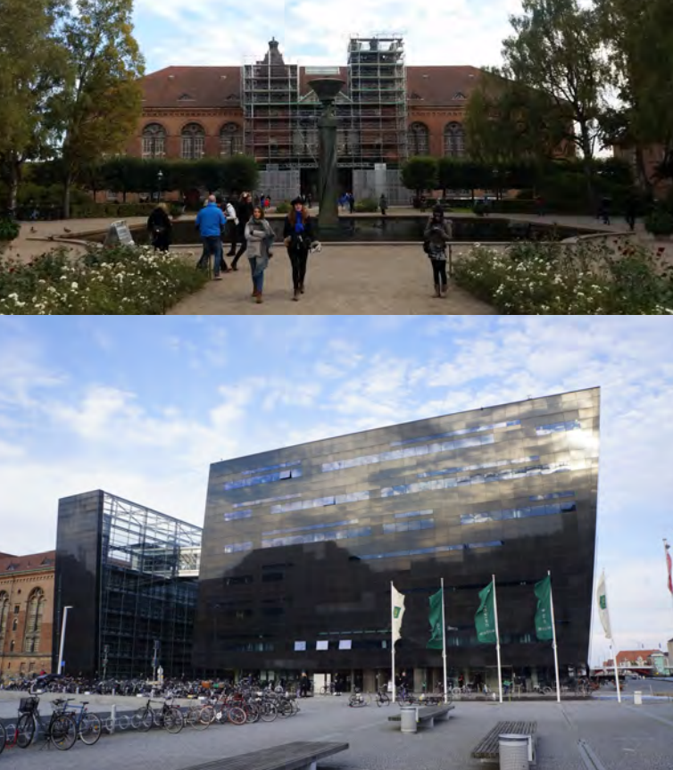
The historic and the modern part of the Royal Library of Copenhagen